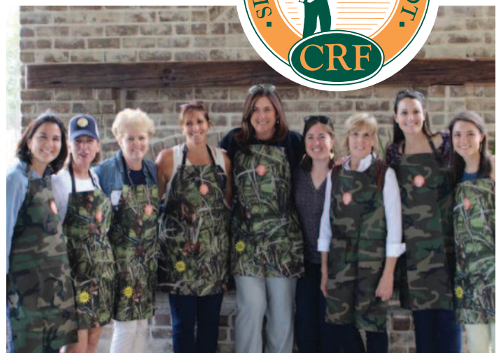
Sporting Clays Shoot volunteer team