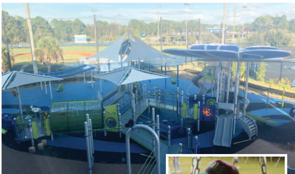
Gregory's Playground 2019

Another phase of the Island Recreation Center's rebuild is completed with the opening of Gregory's Playground. Many thanks go to the Children's Relief Fund, Hilton Head Kiwanis Club, Town of Hilton Head Island and People for Park for making this dream come true for our community. This new state of the art inclusive playground replaces the first one