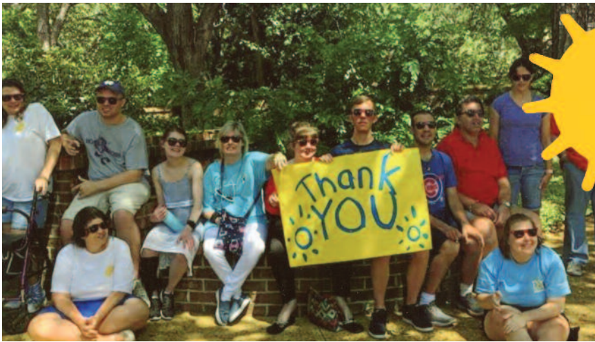
Pockets Full of Sunshine continues to be thankful for Children's Relief Fund support!